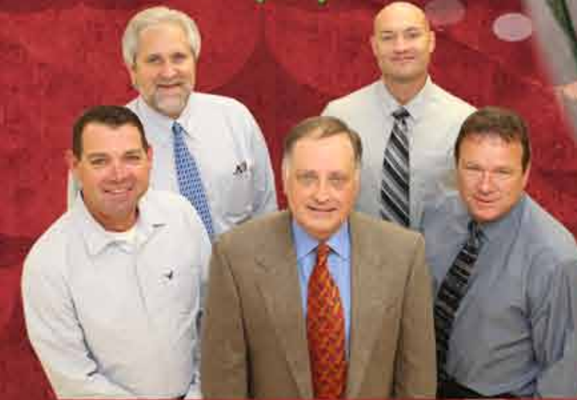
General Manager & Staff