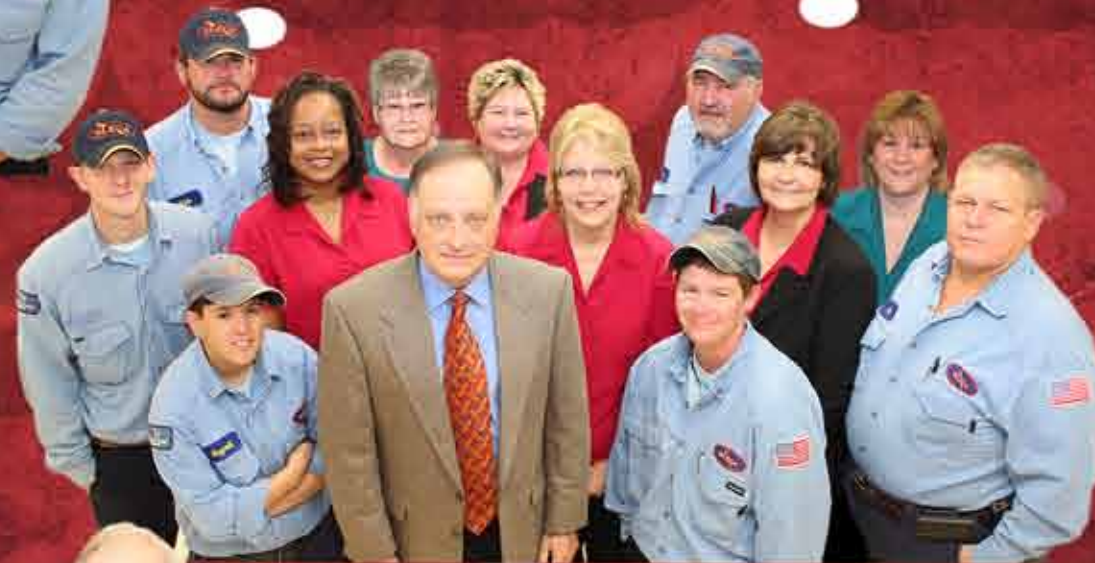
Member Services & Corporate Services