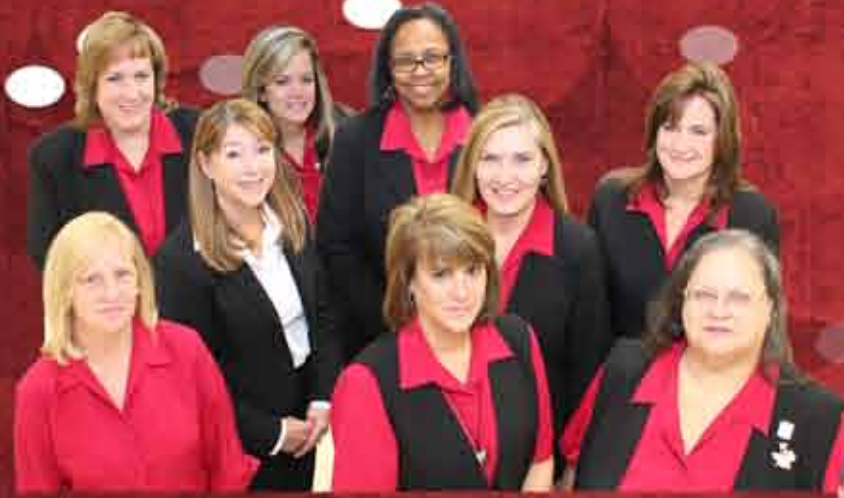
Finance & Accounting

Merry Christmas & Happy New Year to all SLECA members from your Board of Directors and employees