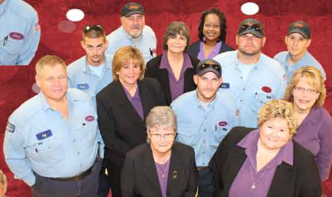
Member Services & Corporate Services