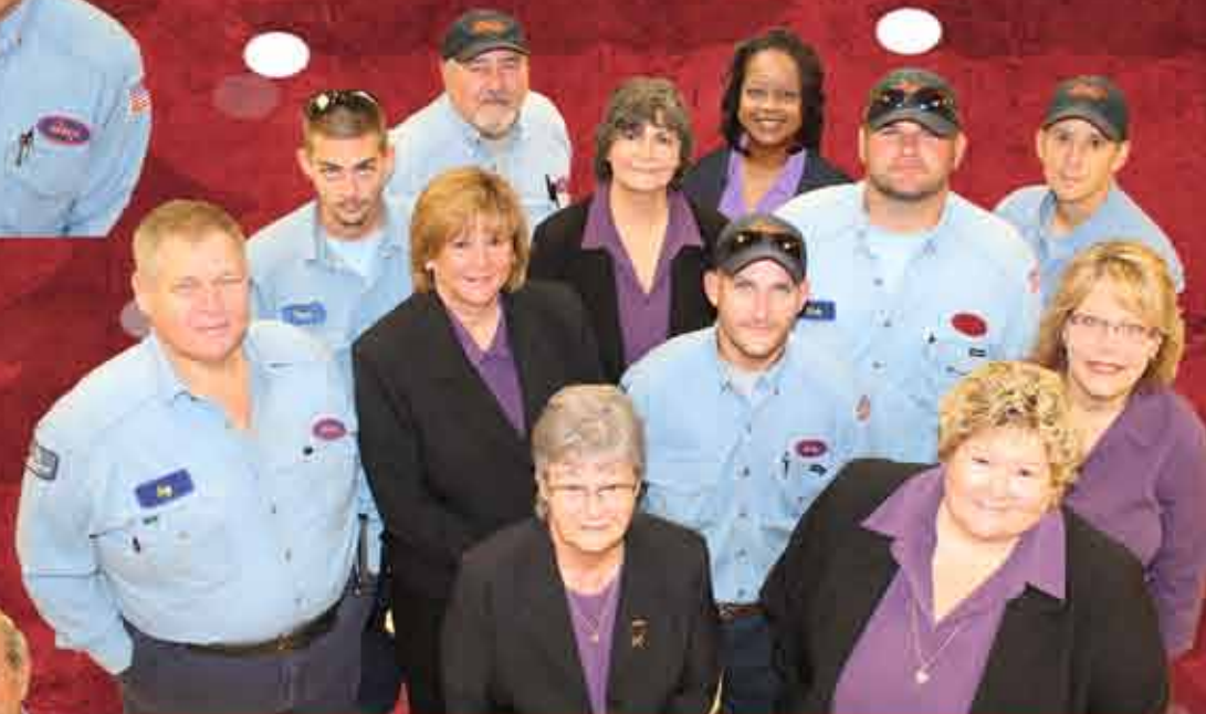
Member Services & Corporate Services