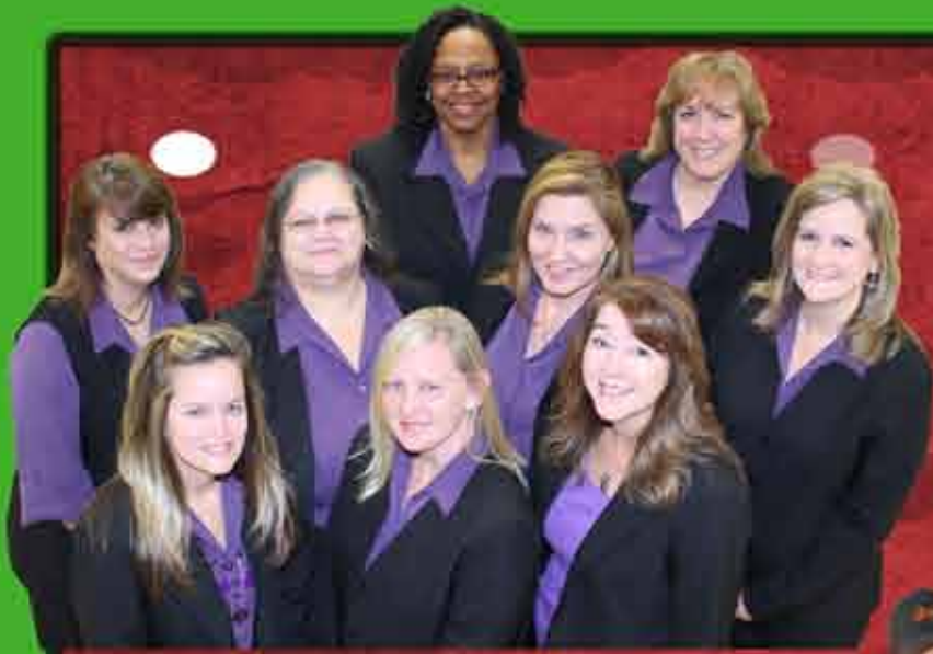
Finance & Accounting

Merry Christmas & Happy New Year to all SLECA members from your Board of Directors and employees