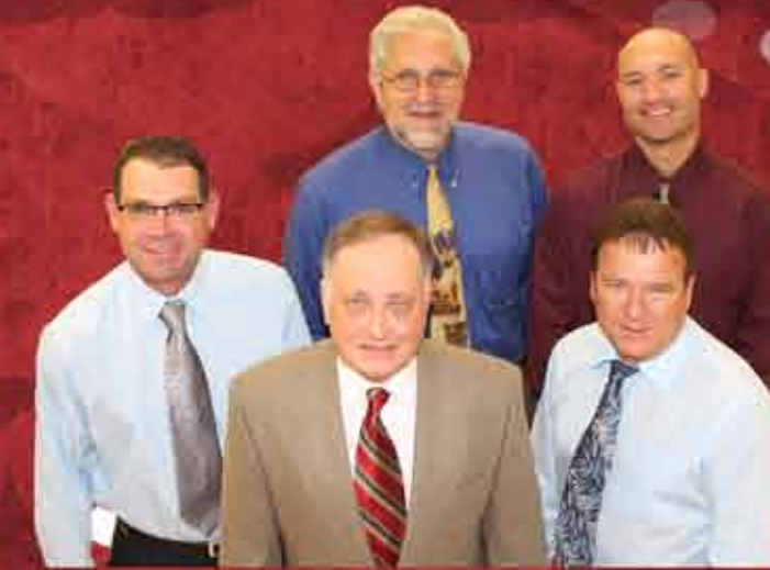
General Manager & Staff